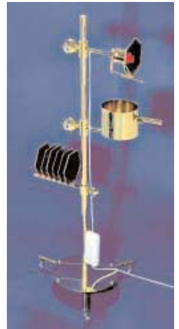
Fig. 25: The combi device.

Supplier information: All the products shown here are available from Markt-Kommunikation GmbH & Co. KG, Postfach 26, D-83621 Dietramszell, telephone 08104/2372, fax 08104/2127. Depending on the model, prices range from DM180.00 (liquid harmonisation disk), DM270.00 (foods/body vitalisation disk) and DM3600.00 (light energy globe). These prices are net of transport and packing costs, according to weight. (The heaviest device weighs 12 kg.)