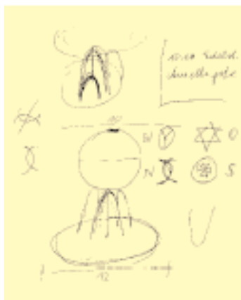
Figs. 10 to 12: Examples of the first sketches drawn by Ingeborg von Reden on receiving her messages. The symbols, measurements, material and shapes (in this example, for the light globe) are "reproduced" exactly as received by her. Often, she cannot see what the end result is going to be. Only when the last small details are communicated does she understand what the object is. For the light energy globe, she did not know what the gentles curves supporting the solid brass globe were supposed to represent. She nonetheless proceeded according to the instructions as received. When the light energy globe was finished, she realised that a double helix was reflected in the base - hence the rounded curves.

quickly learn the theory of equilibrium, in both the physical and abstract sense. Where the balance is disrupted, the picture is ruined. You have to realise that as well as putting together, we can also take apart, and that the process of building up layers of paint and pigments is subject to very specific laws", she says.