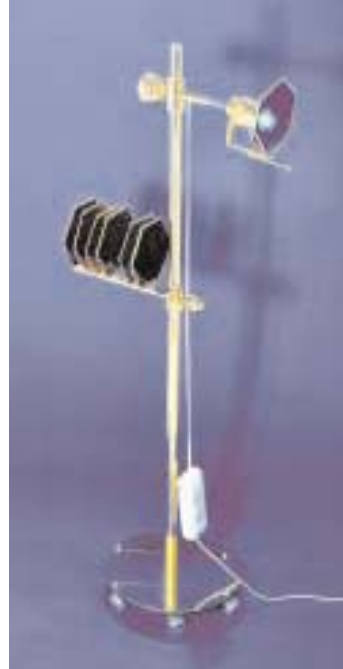
Fig. 24: The colour therapy device.