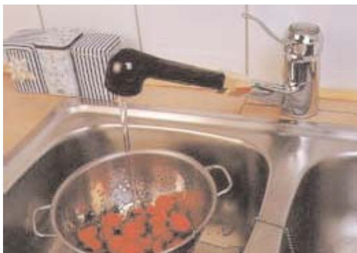
Fig. 13: For the vitalisation of drinking water. The light energy device is simply screwed on between the pipe and the tap. The unit is available in a range of sizes and thicknesses, e.g. also for house connections. Chrome-plated steel devices are available for outdoor facilities (water connections for gardens, swimming pools, etc.).

her suffering in her childhood, youth and early adulthood was so she could gain first-hand physical experience of how the organism works, since she was