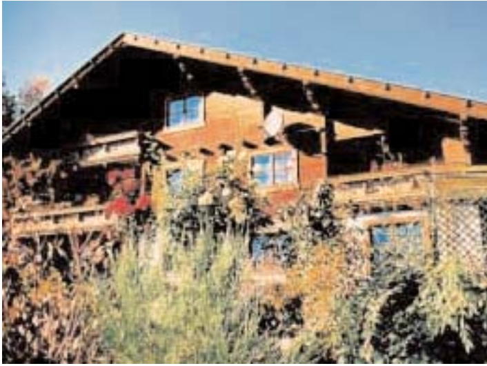
Fig. 2: The south side of the von Reden home, with some of the flourishing blooms, at 1100 metres above sea level.

like to implement in practice", she says. Clearly, she has lost nothing of her enthusiasm and creativity, even though she has been persecuted, exploited and robbed by vultures in the alternative energy sector, like almost no other. The amazing,