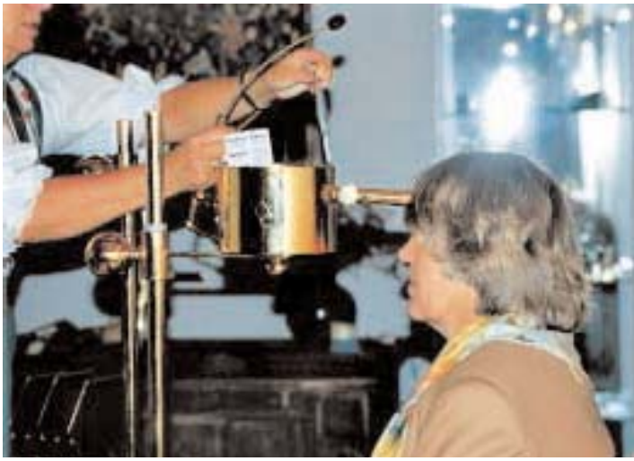
Fig. 4: All the items selected by the client are placed in a therapy device, also developed according to messages received from Paracelsus and Tesla. This device potentiates stones and homeopathic substances.

Reden, the twofold burden of mental and physical stress again brought her close to death. And then, flying in the