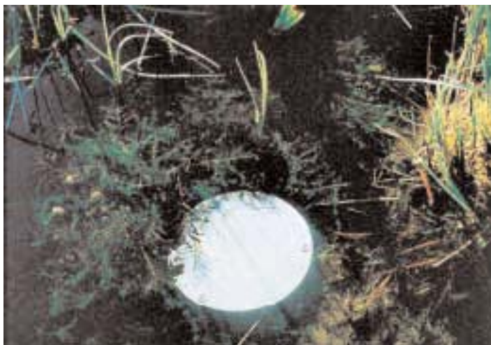
Fig. 14: The oxygen disk for swimming pools, ponds and biotopes. This chrome-plated steel disk, round 30 cm in diameter, stimulates oxygen production in the water within a very short time. The positive change in the water is measurable.

Ingeborg has all this knowledge, simply because it has been given to her. What's more, she