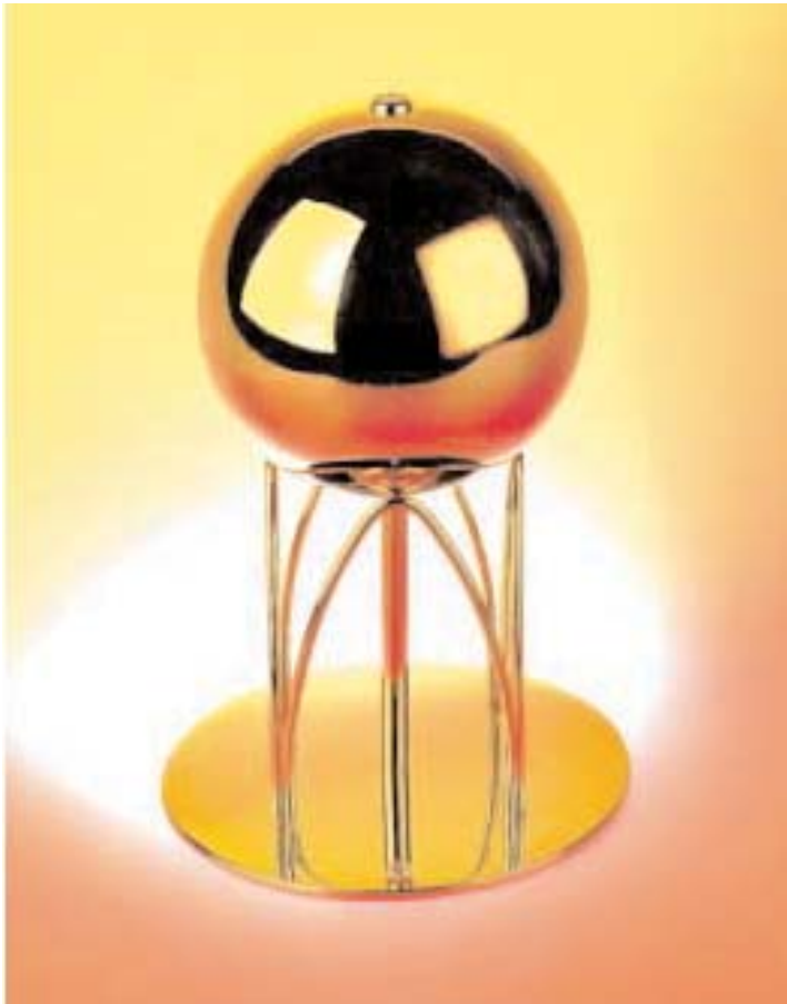
Fig. 19: The light energy globe acts within a radius of 15 metres to remove interference in your home from terrestrial radiation, electrosmog, etc.

quanta in the juice coherent. If water is placed on the disk, it will have a detoxifying action via the lymph.