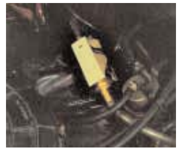
Fig. 22: Device to reduce diesel fuel consumption and contaminant emissions (measurement results show fuel savings of up to 21%). Devices are available for trucks, cars and f.h.p. motors.

This energy disk is worn on a chain around the neck, and is used primarily to activate the thymus gland (general strengthening of the immune system) and the heart chakra (general harmonisation of the organism). Again, the disk is made from solid brass with highly polished, 24-carat hard gold