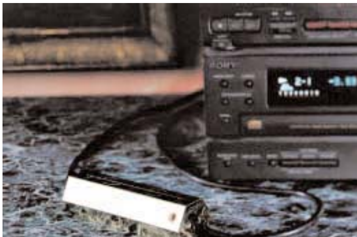
Fig. 20: The electroharmonisation device. The electrical cable is drawn through the device.

For example, if a bag of industrial sugar, which is known to be laevorotatory, is placed for ten minutes on the food disk, the sugar becomes permanently dextrorotatory. This should not be seen as an encouragement to use industrial sugar, but there are people who are simply unwilling or unable to give up sugar. In any case, sugar just one example of a wide range of possible applications. For