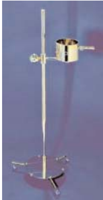
Fig. 23: The potentiation device.

pioneer in healing, working under "guidance from above", and she is genuinely committed to performing that role, as can be seen from her first inventions as described here. raum&zeit will certainly try to keep in touch with the future achievements of this extraordinary woman.