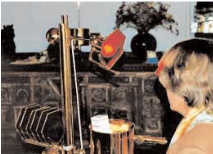
Fig. 6: While the potentiating device remains directed at the heart chakra, a "wave application" procedure is carried out. Inquiry for both colours and wavelengths is conducted with a one-hand diagnosis rod, see Fig. 7.

'please - I have a baby at home', so that someone would look after my child if I suddenly collapsed and was taken to hospi-