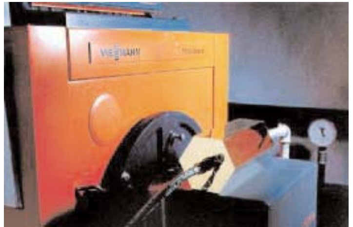
Fig. 21: Device for a gas-fired or oil-fired heating system, to reduce fuel consumption and reduce the emission of contaminants.

decorative piece that would grace any living room. The device acts within a radius of 15 metres in all directions to harmonise and remove the interference from any geopathogenic zones and radiation fields in the home (including radioactivity). The device acts through walls, and its effect is